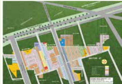
Plots of different sizes at the city's premium location