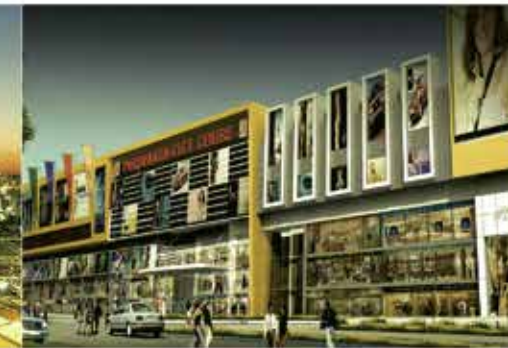
Sonipat City Centre Adjoining to Sonipat City Centre