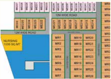
Latest Interior Design, Well Ventilation, Greenery and World-class Accessories