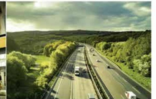
NH-334B Less than 1 Km from the NH-334B