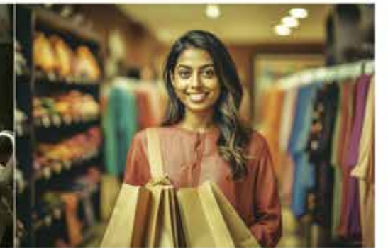
Malls Nearby retail and entertainment centers