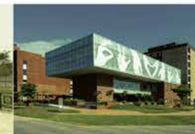
Ashoka University Academic excellence within reach