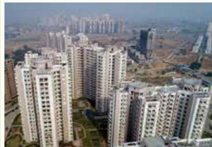
Ready-to-move 3, 4 & 5 BHK Luxury Apartments