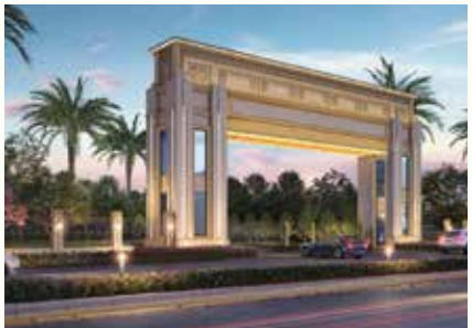
The Lush Green Address of More Space Freedom and Privacy

MAPSKO ASPR GREENZ Sec 35, Sonipat HRERA-PKL-SNP-397-2023