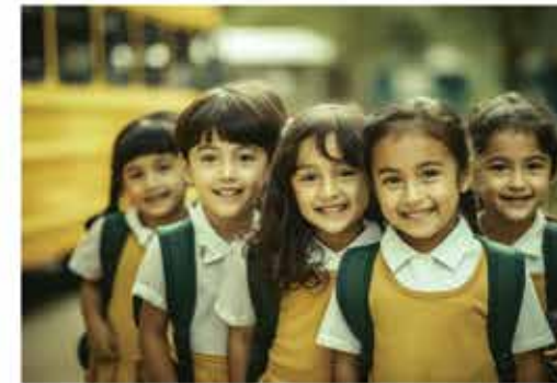
Schools Convenient learning hubs nearby