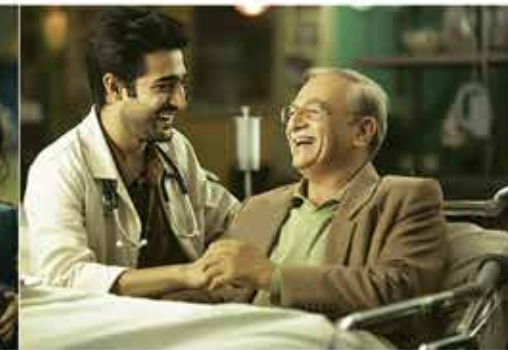
Hospitals Close-knit medical facilities network