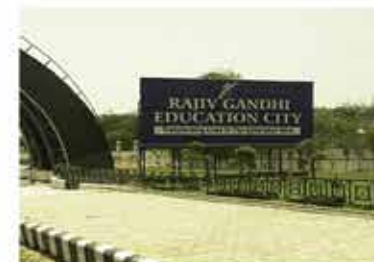
Rajiv Gandhi Education City Education hub at arm's reach