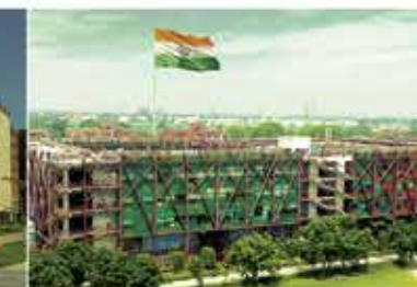
O.P. Jindal Global University Premier education campus proximity