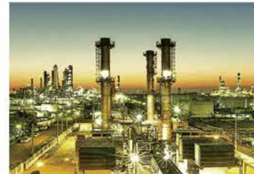
IMT Kharkhoda 10 mins distance from IMT Kharkhoda (Maruti Suzuki Plant)