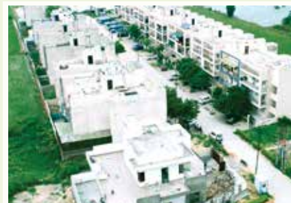
The Lush Green Address of More Space Freedom and Privacy