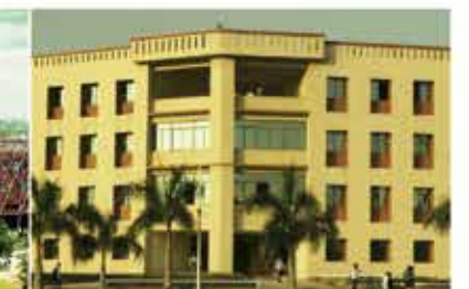
IIT Sonipat Elite technical institute accessible nearby