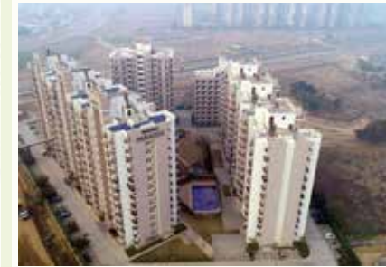
Plots of different sizes at the city's premium location