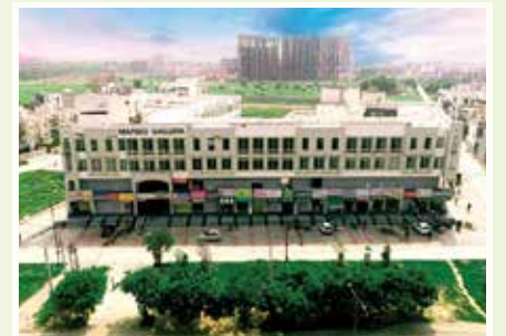
2 & 3 BHK Luxury Apartments connected to National Highway-8