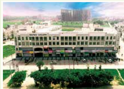
Shopping Outlets in Sector-27, Sonipat